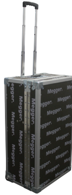
1010-832 Hard-Sided transit case