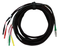
1009-322 Set of primary test leads (1 each)

Used to carry power cord, Ethernet cable, and test leads