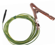
2003-724 Ground lead (1 each)

green with yellow, with large ground clip, 20 ft