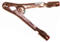
Large test clip (1 each) red, 40 mm opening