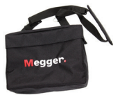
90001-165 Accessory carry case (1 each)

Accessories included in standard set of test leads.