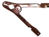
640267 Large test clip (1 each) black, 40 mm opening