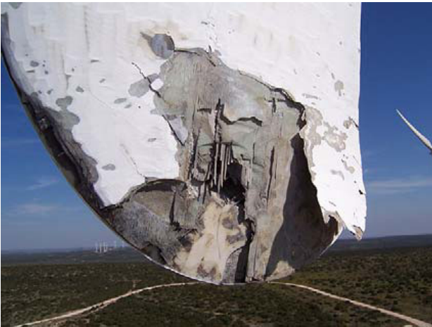
Fig 3: Entry point at tip of turbine blade from a lightning strike