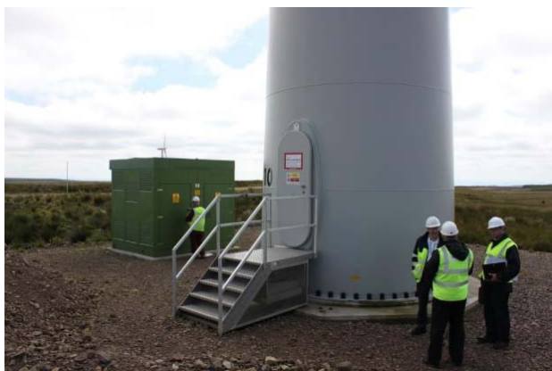
Fig 6: Turbine base