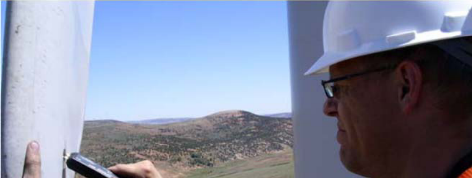
Fig 10: Connection at blade's tip