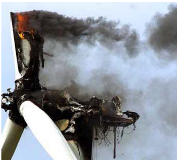
Fig 4: Catastrophic failure of a wind turbine due to a lightning strike