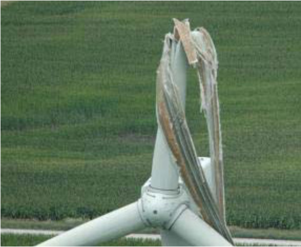
Fig 2: Turbine blade damaged by a lightning strike