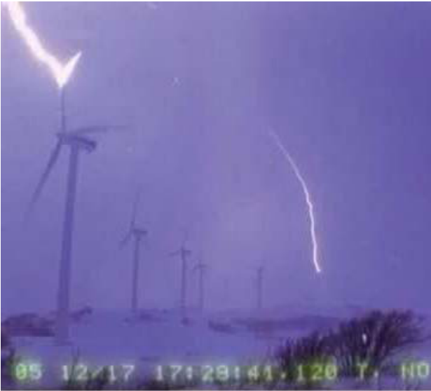
Fig 1: Lightning hitting wind turbines during a storm

The most significant danger facing wind turbines is damage from lightning strikes (see figure 1). A German study found that 80% of wind turbine insurance claims paying out for damage compensation were caused by lightning strikes.