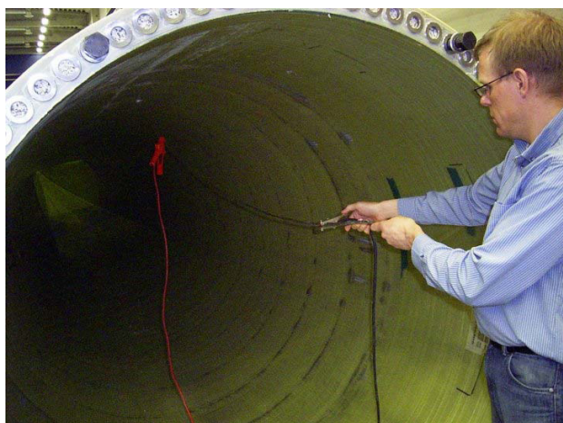
Fig 9: Connection at blade's root