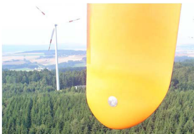
Fig 5: Blade tip

The protection takes the form of a low resistance path to ground. The path goes from the blade's tip (figure 5) to the base of the turbine (figure 6). This path is shown in figure 7.