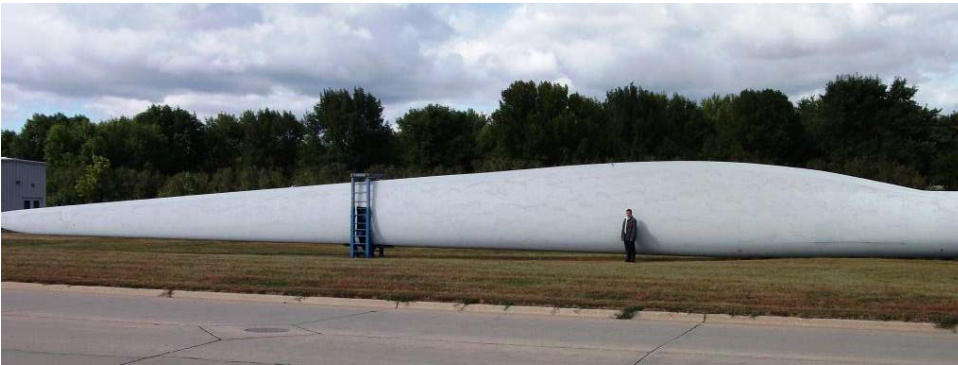
Fig 11: Turbine blade laid down at ground level

The length of a turbine blade can be seen in figure 11. The size of the turbines pose a problem, because low resistance ohmmeter test leads are typically very short. Due to the size of the wind turbines, some extra-long leads are required, often up to 100 m.