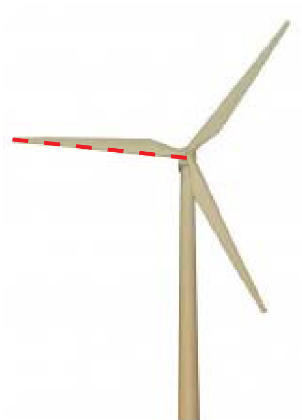
Fig 8: Lightning protection conductor inside wind turbine blade (in red)

When testing on the production line, the conductor inside the blade is tested on its own. The connection points are shown in figures 9 and 10.