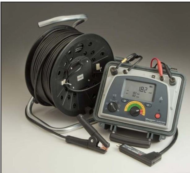
Fig 12: DLRO10HD with a set of KC test leads

Benefits of the DLRO10HD and KC test leads: