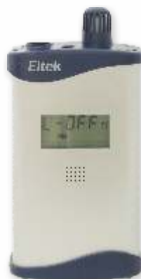
MS47AC / MS47B

Indoor, AC mains or battery operated air quality transmitter with built-in CO 2 0-5000ppm NDIR technology, RH and temperature sensors.