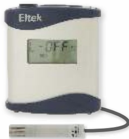
MS13E / MS14E

MS13E and RHT10E high spec RH and temperature probe can be placed precisely where needed. MS14E additionally provides two temperature (thermistor) inputs.